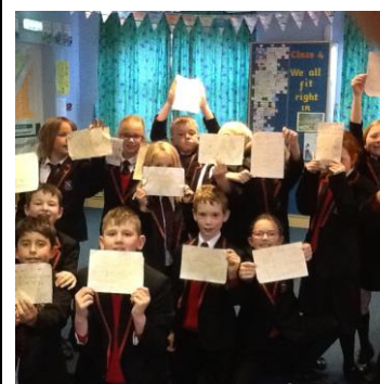
Writing in Egyptian hieroglyphics