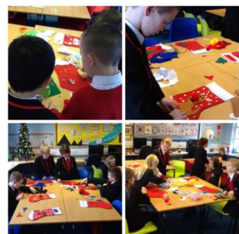
DT day embroidering our stockings

We have had a fantastic term in Class 4! We have been really busy in our lessons and have learnt about different countries in geography, Ancient Egypt in history, light and states of matter in science and People of God in RE.