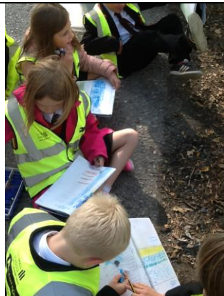
Using oil pastels to create a landscape image.