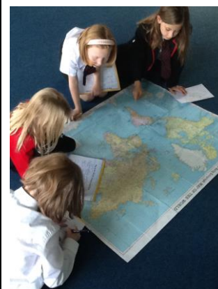
Using maps to locate countries